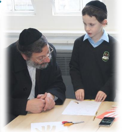
My Family Tree